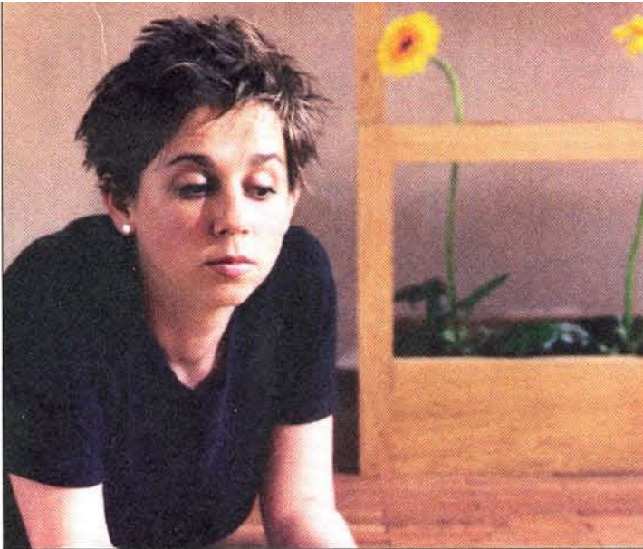
Left: A bench that allows flowers to grow through it. Below: a talking tab recites vegetarian recipes to a pot of basil