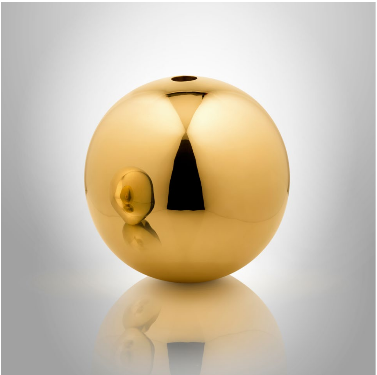
Ball Vase, 2006